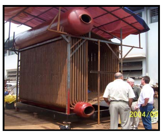
Thermic's Boiler production inspected and witness by external inspector.