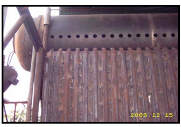
Detail inspection during manufacture is performed on every aspect that goes into Thermic's Boiler.