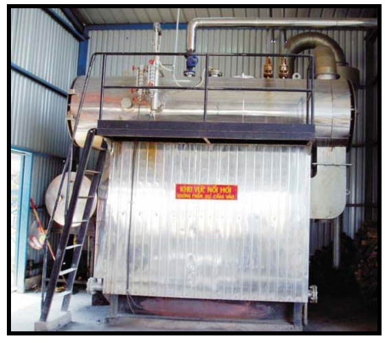
M.E.S. PLANTS Site: GOLDEN MANUFACTURERS BOILA CIRCLE, KALABO INDUSTRIAL ESTATE NASINU, FIJI 1x 4MW Wood Waste Steam Boilers Complete Packaged Steam Plant